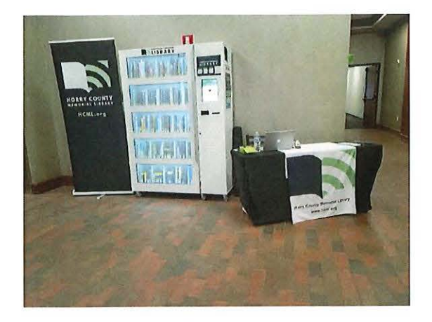
Library-to-Go Opening Day