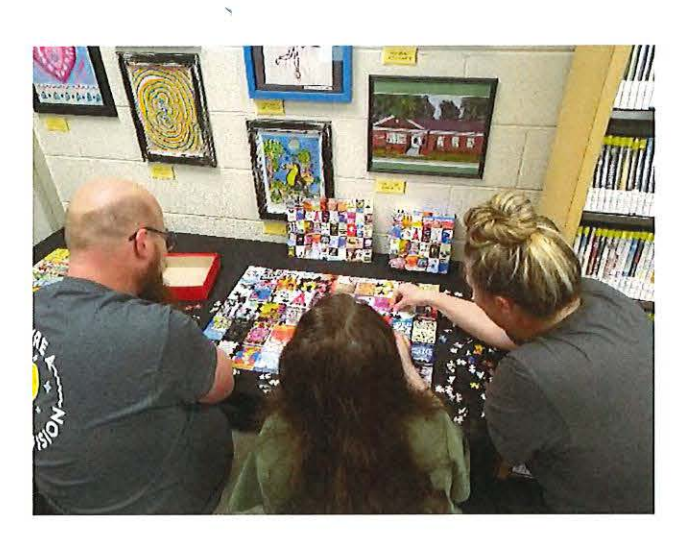
Community Puzzle at Aynor Library