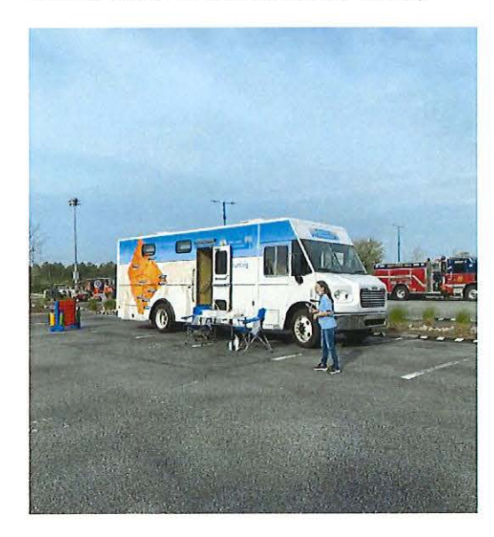
Bookmobile preparing for Touch-a-Truck