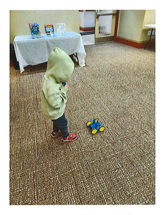
Robotics Hour at Surfside Beach Library