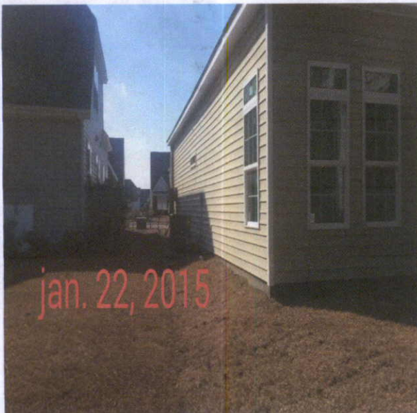
Right side HVAC