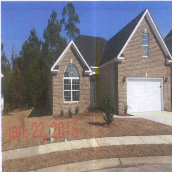
Front Left Side

If using the Elevation Certificate to obtain NFIP flood insurance, affix at least 2 building photographs below according to the instructions for Item A6. Identify all photographs with date taken; "Front View" and "Rear View"; and, if required, "Right Side View" and "Left Side View." When applicable, photographs must show the foundation with representative examples of the flood openings or vents, as indicated in Section A8. If submitting more photographs than will fit on this page, use the Continuation Page.