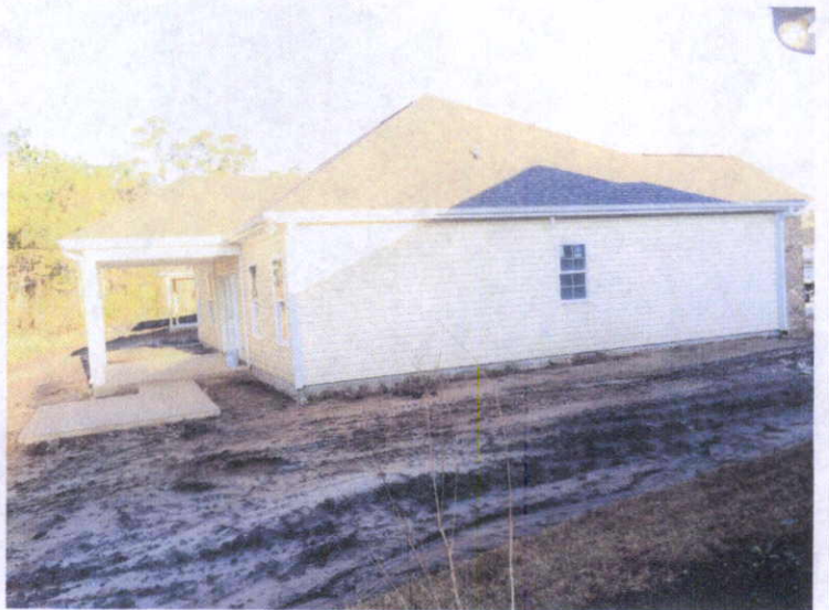
Left Side View 01/21/15