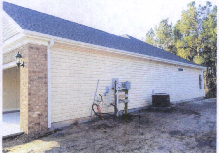
Right Side View 01/21/15