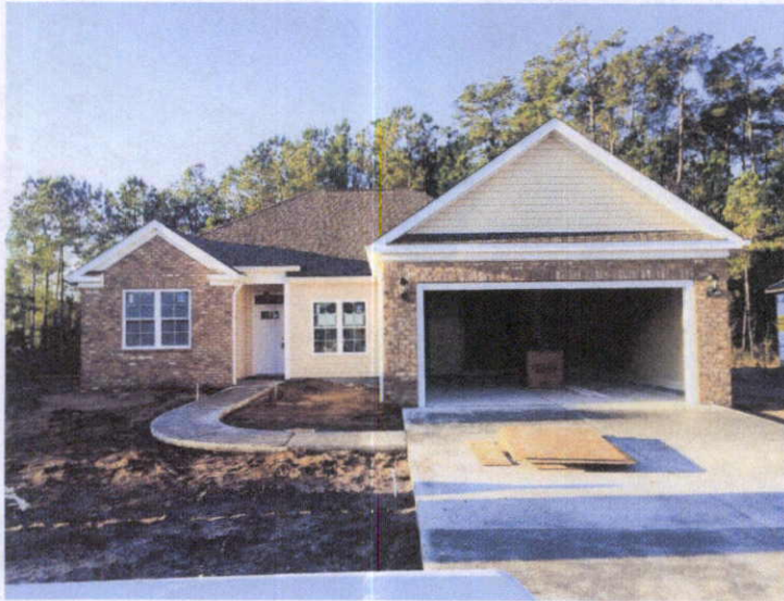
Front View 01/21/15

If using the Elevation Certificate to obtain NFIP flood insurance, affix at least 2 building photographs below according to the instructions for Item A6. Identify all photographs with date taken; "Front View" and "Rear View"; and, if required, "Right Side View" and "Left Side View." When applicable, photographs must show the foundation with representative examples of the flood openings or vents, as indicated in Section A8. If submitting more photographs than will fit on this page, use the Continuation Page.