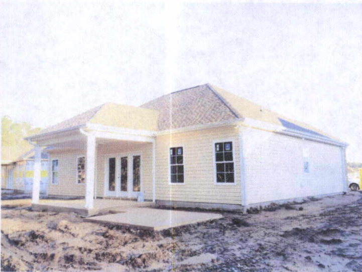
Rear View 01/21/15