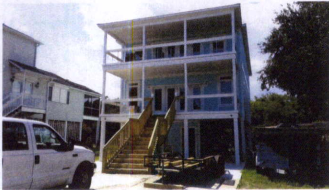
FRONT VIEW PHOTOS TAKEN AUGUST 13, 2015

If using the Elevation Certificate to obtain NFIP flood insurance, affix at least 2 building photographs below according to the instructions for Item A6. Identify all photographs with date taken; "Front View" and "Rear View"; and, if required, "Right Side View" and "Left Side View." When applicable, photographs must show the foundation with representative examples of the flood openings or vents, as indicated in Section A8. If submitting more photographs than will fit on this page, use the Continuation Page.