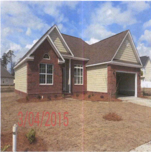
Front Left side

If using the Elevation Certificate to obtain NFIP flood insurance, affix at least 2 building photographs below according to the instructions for Item A6. Identify all photographs with date taken; "Front View" and "Rear View"; and, if required, "Right Side View" and "Left Side View." When applicable, photographs must show the foundation with representative examples of the flood openings or vents, as indicated in Section A8. If submitting more photographs than will fit on this page, use the Continuation Page.