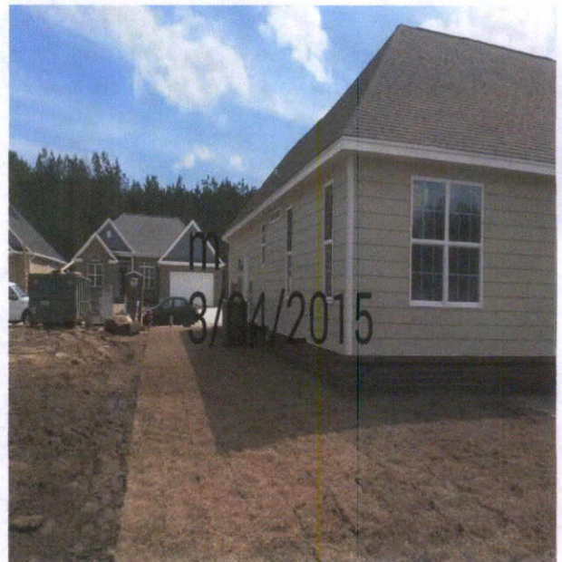
Right side HVAC