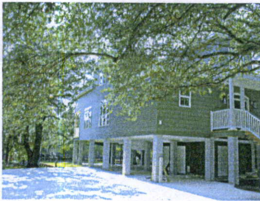
Front Left (6/18/15)

If using the Elevation Certificate to obtain NFIP flood insurance, affix at least 2 building photographs below according to the instructions for Item A6. Identify all photographs with date taken; "Front View" and "Rear View"; and, if required, "Right Side View" and "Left Side View." When applicable, photographs must show the foundation with representative examples of the flood openings or vents, as indicated in Section A8. If submitting more photographs than will fit on this page, use the Continuation Page.