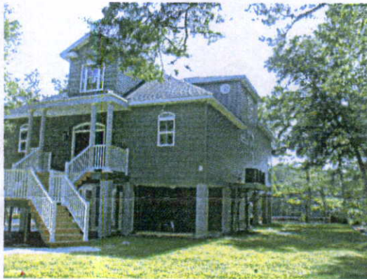
Front Right (6/18/15)