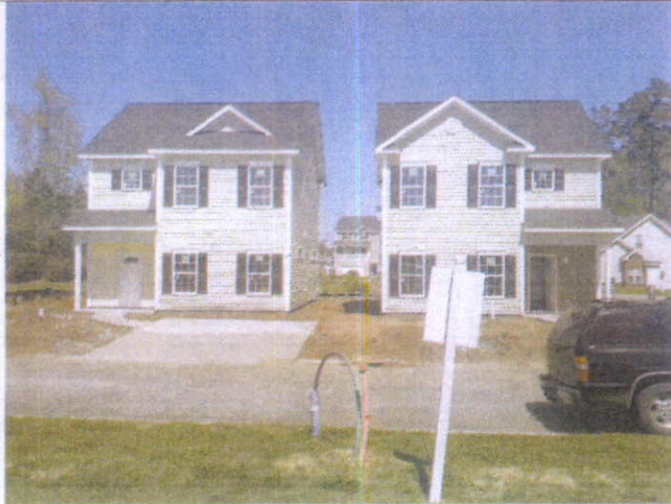
FRONT VIEW (UNIT 19 ON RIGHT)

If using the Elevation Certificate to obtain NFIP flood insurance, affix at least 2 building photographs below according to the instructions for Item A6. Identify all photographs with date taken; "Front View" and "Rear View"; and, if required, "Right Side View" and "Left Side View." When applicable, photographs must show the foundation with representative examples of the flood openings or vents, as indicated in Section A8. If submitting more photographs than will fit on this page, use the Continuation Page.