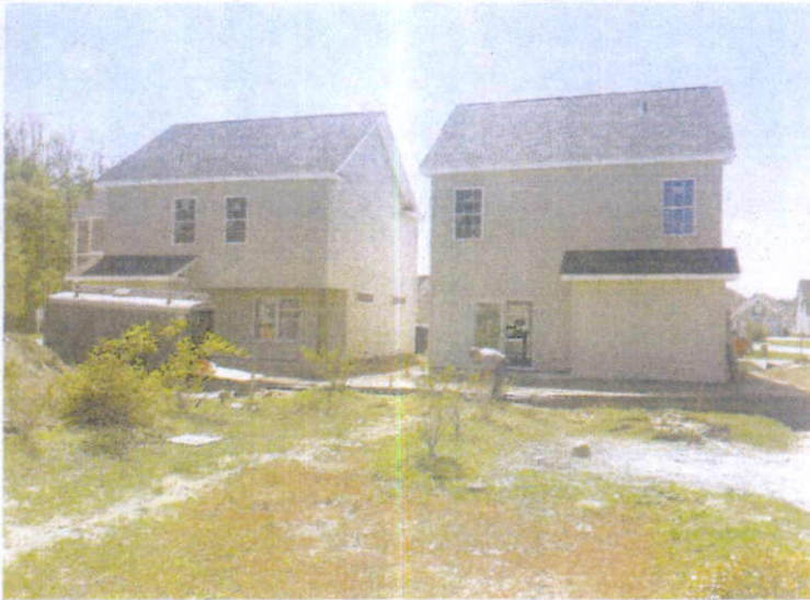
REAR VIEW (UNIT 19 ON LEFT)