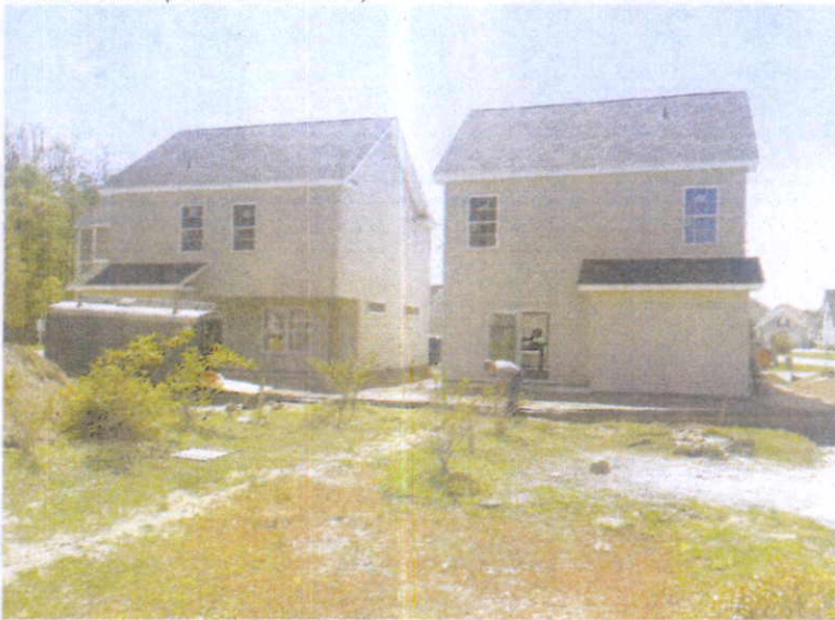
REAR VIEW (UNIT 20 ON RIGHT)