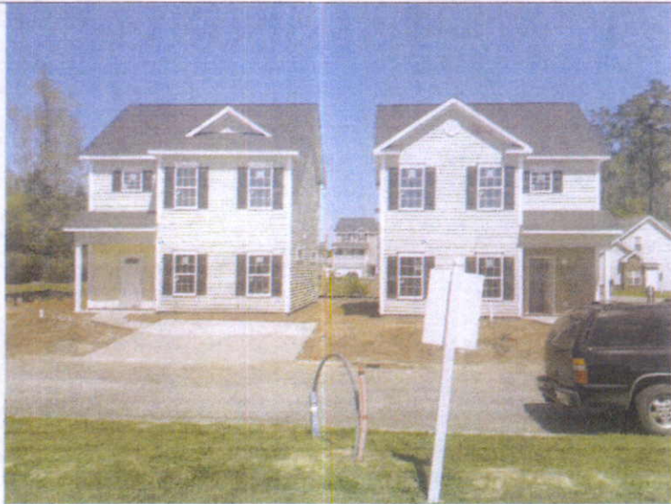
FRONT VIEW (UNIT 20 ON LEFT)

If using the Elevation Certificate to obtain NFIP flood insurance, affix at least 2 building photographs below according to the instructions for Item A6. Identify all photographs with date taken; "Front View" and "Rear View"; and, if required, "Right Side View" and "Left Side View." When applicable, photographs must show the foundation with representative examples of the flood openings or vents, as indicated in Section A8. If submitting more photographs than will fit on this page, use the Continuation Page.