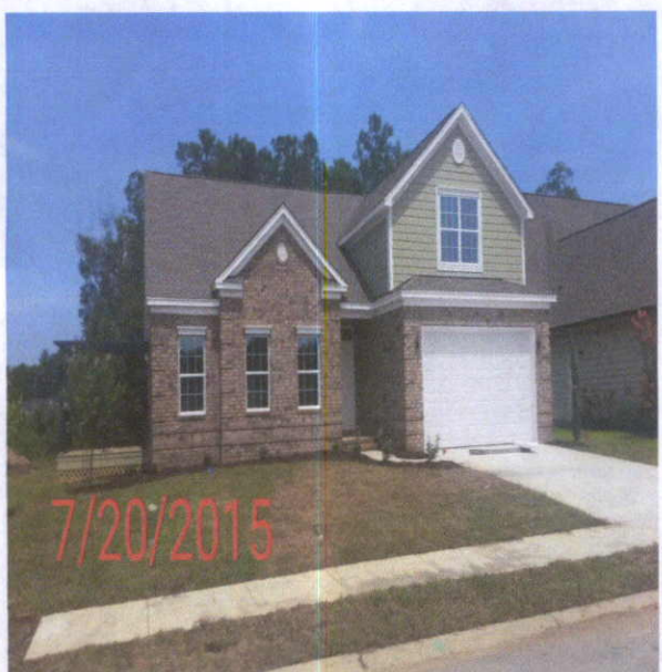
Front Left side

If using the Elevation Certificate to obtain NFIP flood insurance, affix at least 2 building photographs below according to the instructions for Item A6. Identify all photographs with date taken; "Front View" and "Rear View"; and, if required, "Right Side View" and "Left Side View." When applicable, photographs must show the foundation with representative examples of the flood openings or vents, as indicated in Section A8. If submitting more photographs than will fit on this page, use the Continuation Page.