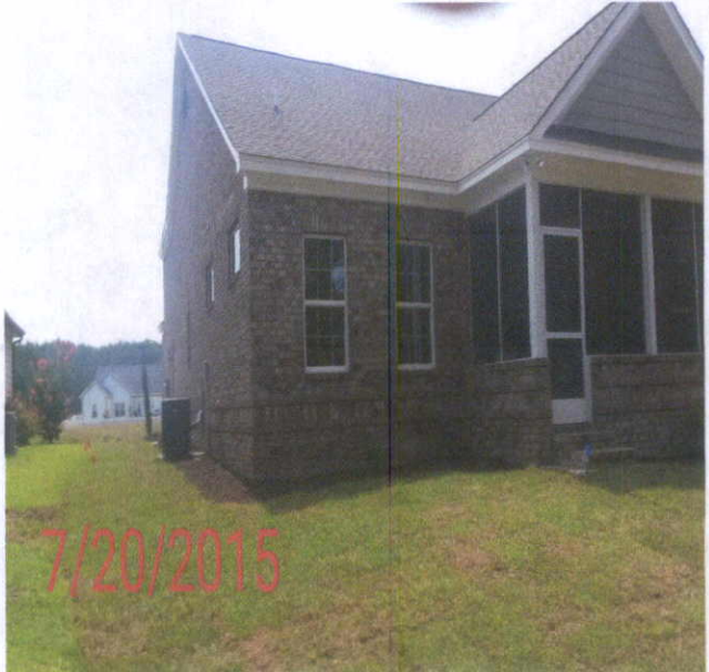
Right side, HVAC, rear