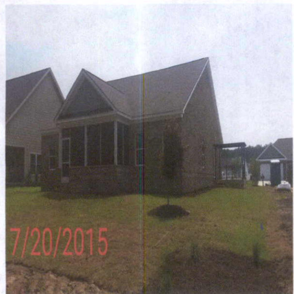
Rear Left side