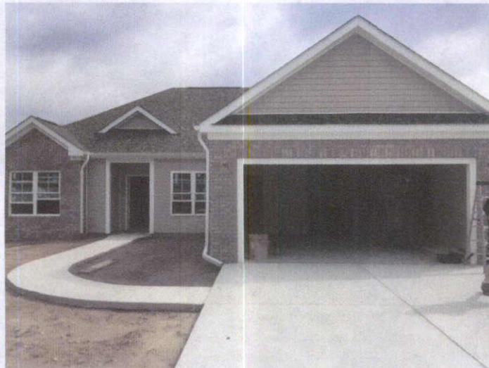
Front View 08/07/15

If using the Elevation Certificate to obtain NFIP flood insurance, affix at least 2 building photographs below according to the instructions for Item A6. Identify all photographs with date taken; "Front View" and "Rear View"; and, if required, "Right Side View" and "Left Side View." When applicable, photographs must show the foundation with representative examples of the flood openings or vents, as indicated in Section A8. If submitting more photographs than will fit on this page, use the Continuation Page.