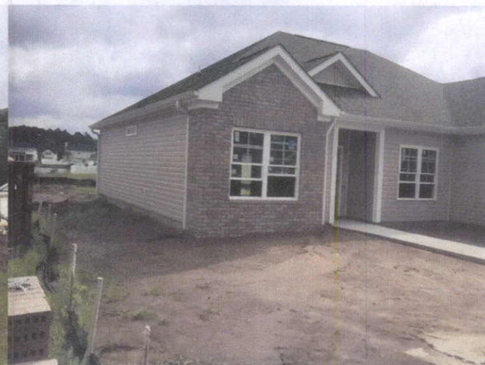
Left Side View 08/07/15