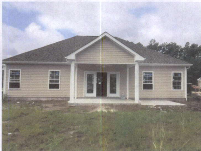
Rear View 08/07/15