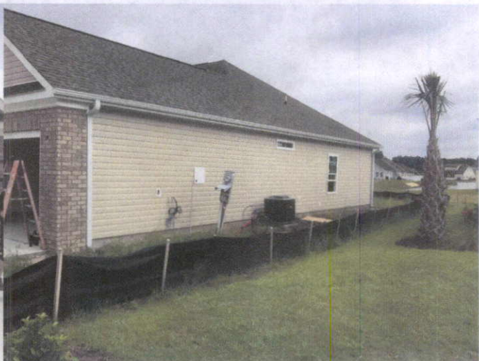
Right Side View 08/07/15