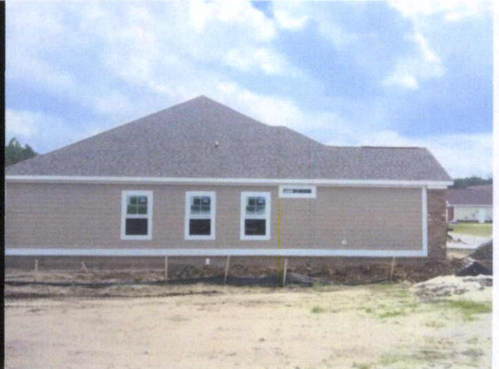
Left Side View (05/19/15)