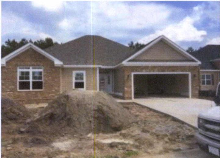
Front View (05/19/15)

If using the Elevation Certificate to obtain NFIP flood insurance, affix at least 2 building photographs below according to the instructions for Item A6. Identify all photographs with date taken; "Front View" and "Rear View"; and, if required, "Right Side View" and "Left Side View." When applicable, photographs must show the foundation with representative examples of the flood openings or vents, as indicated in Section A8. If submitting more photographs than will fit on this page, use the Continuation Page.