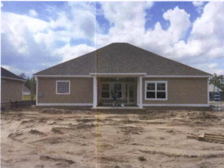
Rear View (05/19/15)