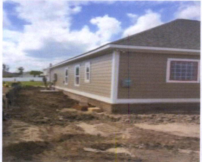
Right Side View (05/19/15)