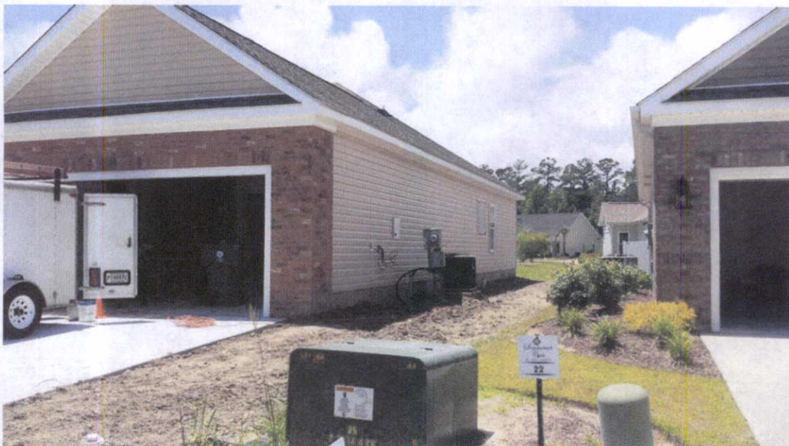
Right-Side View 05/26/15