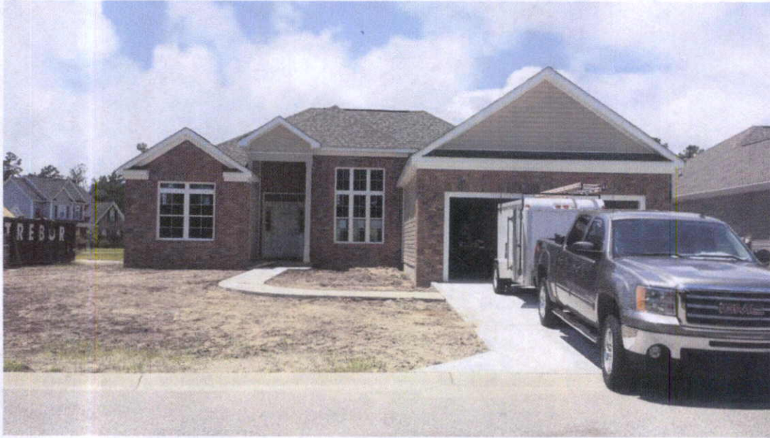
Front View 05/26/15

If using the Elevation Certificate to obtain NFIP flood insurance, affix at least 2 building photographs below according to the instructions for Item A6. Identify all photographs with date taken; "Front View" and "Rear View"; and, if required, "Right Side View" and "Left Side View." When applicable, photographs must show the foundation with representative examples of the flood openings or vents, as indicated in Section A8. If submitting more photographs than will fit on this page, use the Continuation Page.