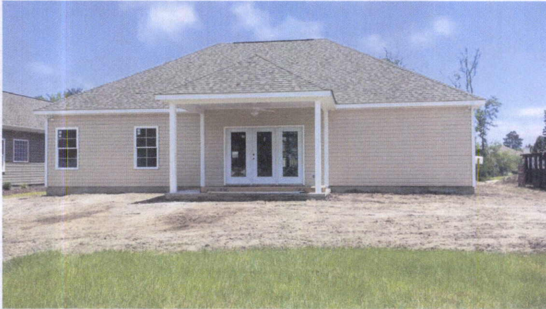
Rear View 05/26/15

If submitting more photographs than will fit on the preceding page, affix the additional photographs below. Identify all photographs with: date taken; "Front View" and "Rear View"; and, if required, "Right Side View" and "Left Side View." When applicable, photographs must show the foundation with representative examples of the flood openings or vents, as indicated in Section A8.