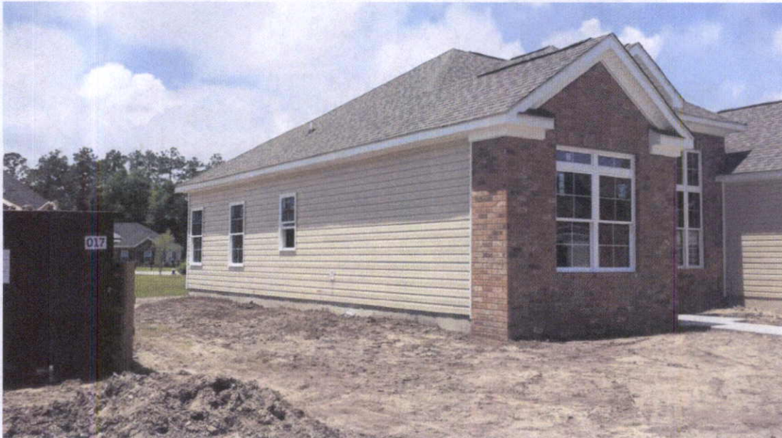
Left-Side View 05/26/15