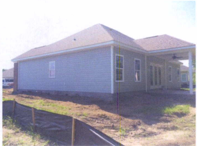
Right Side View (6/23/15)