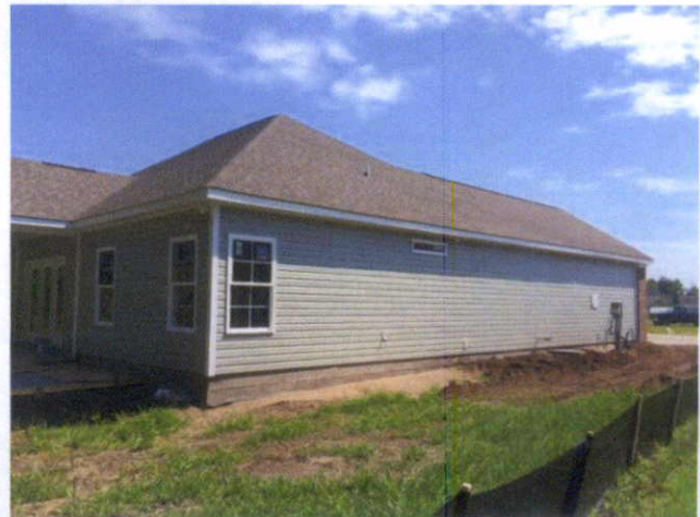
Left Side View (6/23/15)