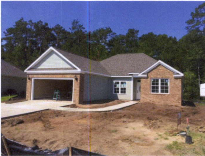
Front View (6/23/15)

If using the Elevation Certificate to obtain NFIP flood insurance, affix at least 2 building photographs below according to the instructions for Item A6. Identify all photographs with date taken; "Front View" and "Rear View"; and, if required, "Right Side View" and "Left Side View." When applicable, photographs must show the foundation with representative examples of the flood openings or vents, as indicated in Section A8. If submitting more photographs than will fit on this page, use the Continuation Page.