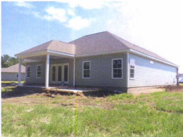
Rear View (6/23/15)