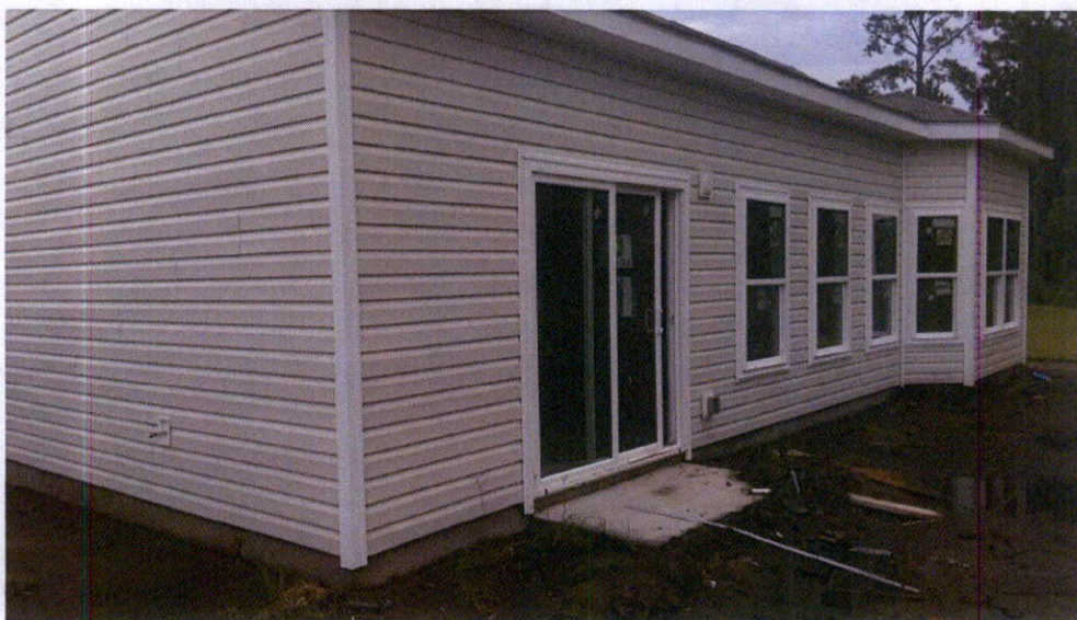
Rear View July 14, 2015