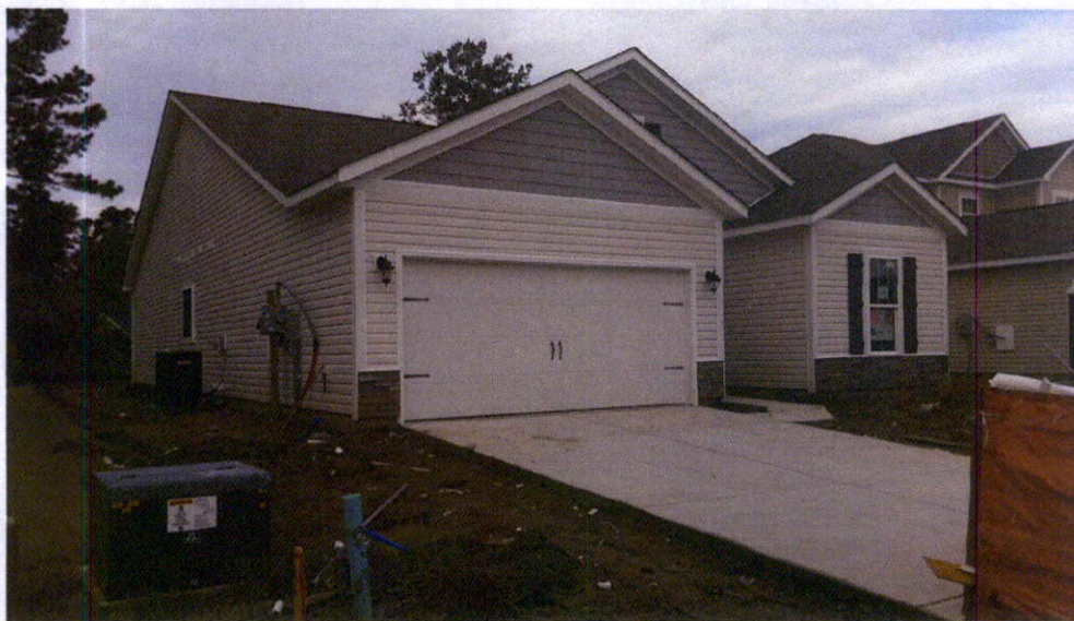
Front View July 14, 2015

If using the Elevation Certificate to obtain NFIP flood insurance, affix at least 2 building photographs below according to the instructions for Item A6. Identify all photographs with date taken; "Front View" and "Rear View"; and, if required, "Right Side View" and "Left Side View." When applicable, photographs must show the foundation with representative examples of the flood openings or vents, as indicated in Section A8. If submitting more photographs than will fit on this page, use the Continuation Page.