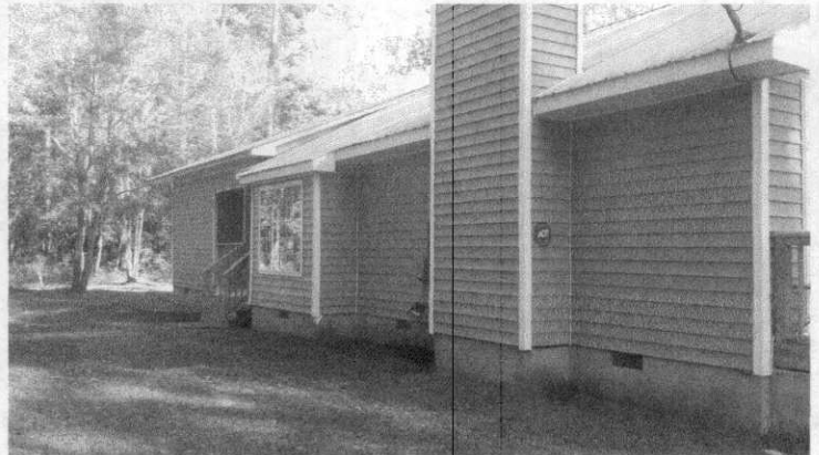
Front & Left Side View ( North & West )