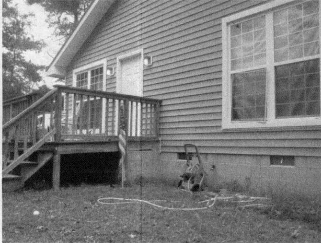
Front View ( West )