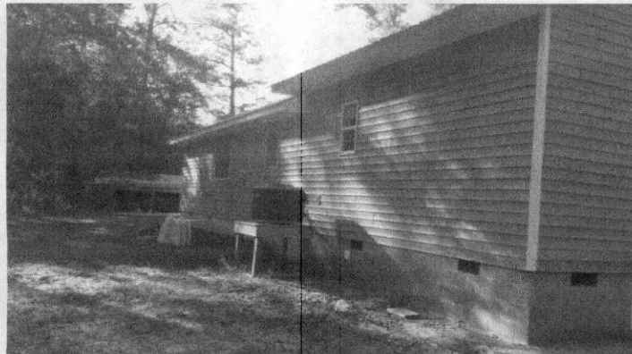
Right Side View ( South )