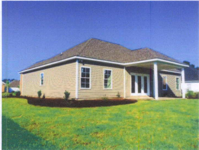
Right Side View 09/01/15