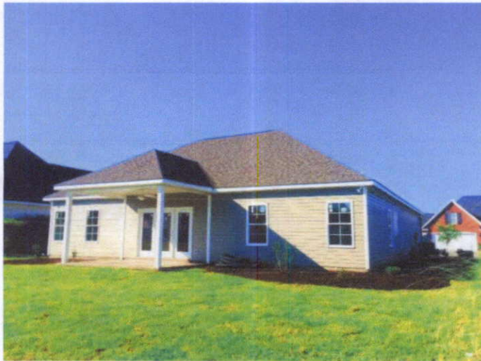
Rear View 09/01/15