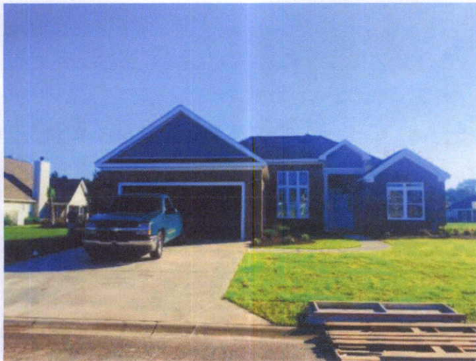
Front View 09/01/15

If using the Elevation Certificate to obtain NFIP flood insurance, affix at least 2 building photographs below according to the instructions for Item A6. Identify all photographs with date taken; "Front View" and "Rear View"; and, if required, "Right Side View" and "Left Side View." When applicable, photographs must show the foundation with representative examples of the flood openings or vents, as indicated in Section A8. If submitting more photographs than will fit on this page, use the Continuation Page.