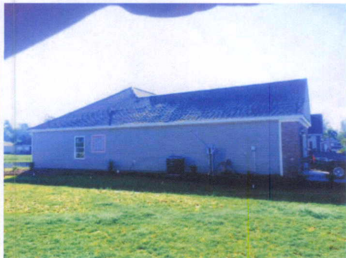
Left Side View 09/01/15