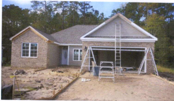
Front View (11/06/15)

If using the Elevation Certificate to obtain NFIP flood insurance, affix at least 2 building photographs below according to the instructions for Item A6. Identify all photographs with date taken; "Front View" and "Rear View"; and, if required, "Right Side View" and "Left Side View." When applicable, photographs must show the foundation with representative examples of the flood openings or vents, as indicated in Section A8. If submitting more photographs than will fit on this page, use the Continuation Page.