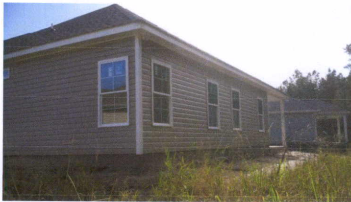
Rear View (11/06/15)