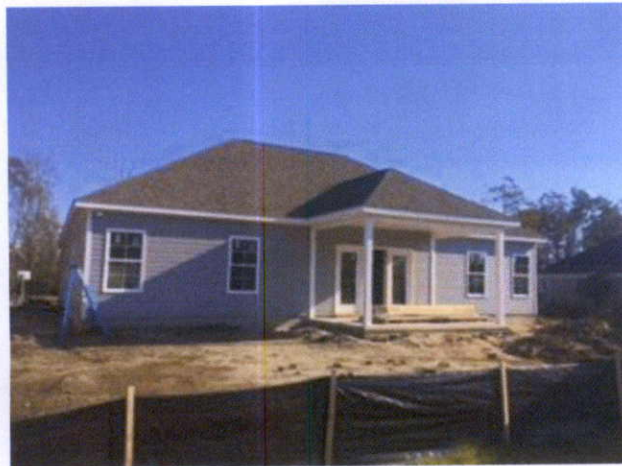
Rear View (12/10/15)