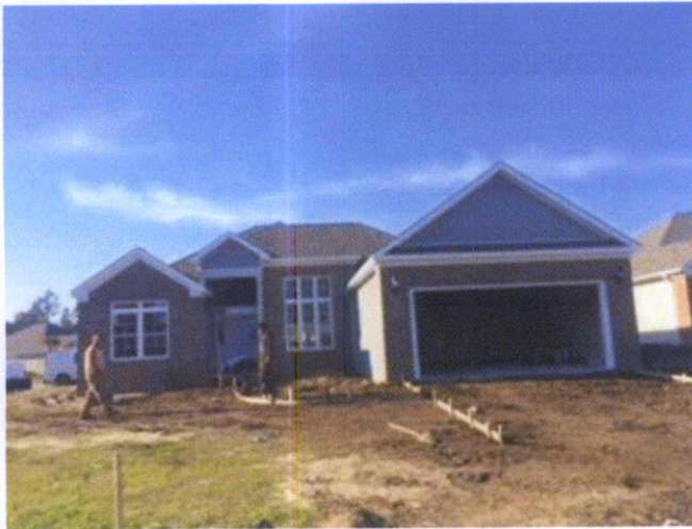
Front View (12/10/15)

If using the Elevation Certificate to obtain NFIP flood insurance, affix at least 2 building photographs below according to the instructions for Item A6. Identify all photographs with date taken; "Front View" and "Rear View"; and, if required, "Right Side View" and "Left Side View." When applicable, photographs must show the foundation with representative examples of the flood openings or vents, as indicated in Section A8. If submitting more photographs than will fit on this page, use the Continuation Page.