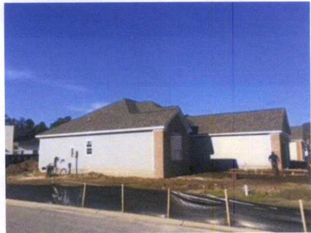
Left Side View (12/10/15)