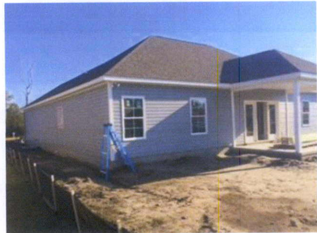
Right Side View (12/10/15)