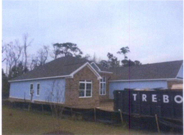
Left Side View (01-06-16)