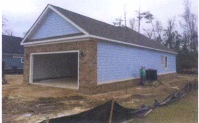
Right Side View (01-06-16)