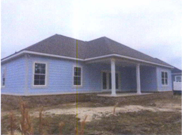
Rear View (01-06-16)