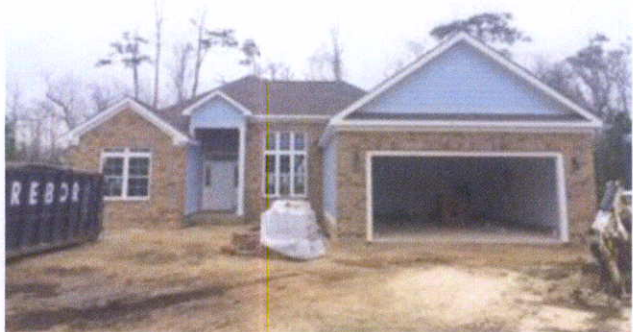
Front View (01-06-16)

If using the Elevation Certificate to obtain NFIP flood insurance, affix at least 2 building photographs below according to the instructions for Item A6. Identify all photographs with date taken; "Front View" and "Rear View"; and, if required, "Right Side View" and "Left Side View." When applicable, photographs must show the foundation with representative examples of the flood openings or vents, as indicated in Section A8. If submitting more photographs than will fit on this page, use the Continuation Page.