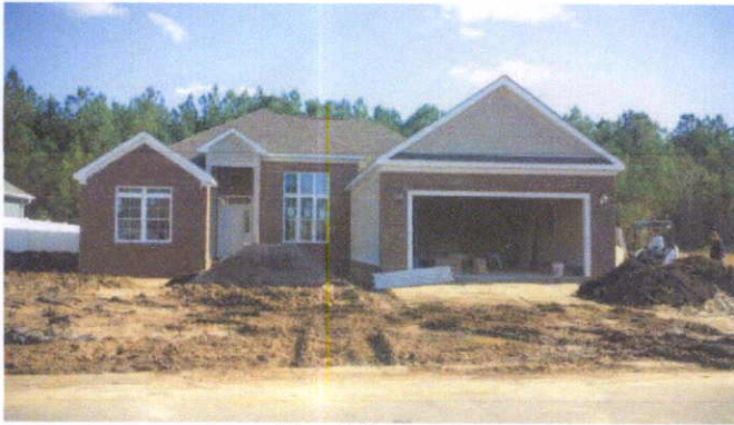
Front View (02-17-16)

If using the Elevation Certificate to obtain NFIP flood insurance, affix at least 2 building photographs below according to the instructions for Item A6. Identify all photographs with date taken; "Front View" and "Rear View"; and, if required, "Right Side View" and "Left Side View." When applicable, photographs must show the foundation with representative examples of the flood openings or vents, as indicated in Section A8. If submitting more photographs than will fit on this page, use the Continuation Page.