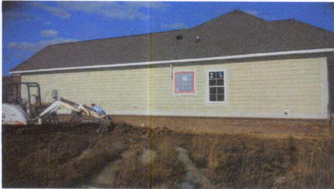
Right Side View (02-17-16)