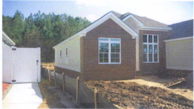
Left Side View (02-17-16)