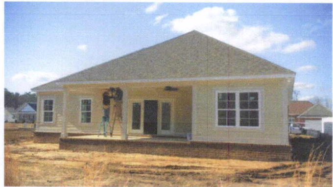
Rear View (02-17-16)