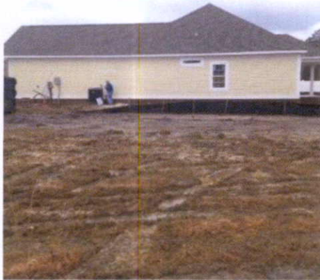
Right Side View (03-04-16)

If using the Elevation Certificate to obtain NFIP flood insurance, affix at least 2 building photographs below according to the instructions for Item A6. Identify all photographs with date taken; "Front View" and "Rear View"; and, if required, "Right Side View" and "Left Side View." When applicable, photographs must show the foundation with representative examples of the flood openings or vents, as indicated in Section A8. If submitting more photographs than will fit on this page, use the Continuation Page.