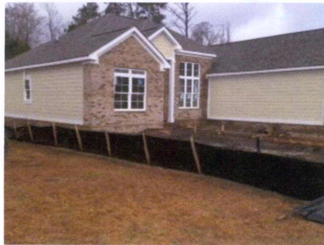
Front & Left View (03-04-16)