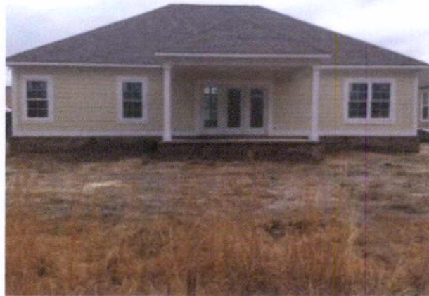
Rear View (03-04-16)